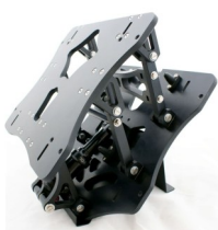
SHOCK-WBV Forms Strategic Partnership with LOKI Dynamics.