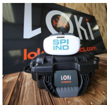
Loki Dynamics Brings Innovative Anti-Seasickness VR to UK