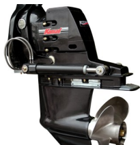
LOKI forms new collaboration with KONRAD MARINE.